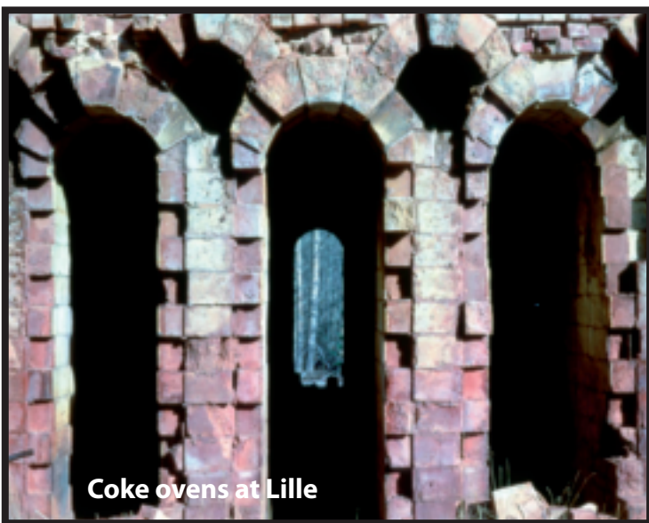
Coke ovens at Lille

Trailhead: North of Frank Slide Centre access road (another option is to park at the Frank Slide Centre and walk back down the paved access road to the cattleguard at the hairpin turn). Cross the cattleguard at the hairpin turn on the Frank Slide Interpretive Centre access road. Take the second road to your left (approximately 250 m from the cattleguard). Park in the meadow. Hike on the rough road that leads into the forest. Once the rough road rejoins the main Lille access road (approximately 1.5 km from the start), turn left and follow the road up the Gold Creek Valley. There is one small crossing of Green Creek, followed by two more substantial crossings of the Gold Creek. For both Gold Creek crossings, there are snowmobile bridges upstream from the vehicle ford. One final crossing at Morin Creek brings you out into the open at what once was the coal mining community of Lille. A bit of searching will find basement depressions, bricks, rusted metal and a couple of fire hydrants. Once in the meadow, if you veer to the left, you will come across the basement foundation of the Lille Hotel, a fine two-storey structure in its day. Continuing in this direction will lead to a large pile of slack coal and the remains of Lille's Bernard-type coke ovens. Note: Lille is an Alberta Provincial Historic Site. Do not disturb or take anything from the site.