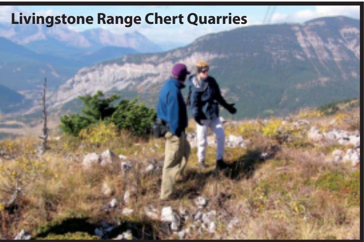
Livingstone Range Chert Quarries

Trailhead: Take Willow Drive west from West Coleman for 1.7 km to the bridge over Star Creek. 100 m past the bridge turn left and drive 700 m (rough road) to the trailhead sign. This route leads through a small canyon to 15 m high Star Creek Falls. In the spring of the year, the creek has much more flow and you will have to stick to the main trail. In autumn, when water levels are much lower, it is possible to make your way up the canyon floor to the falls.